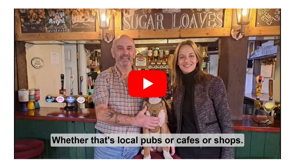
Earlier this month I visited businesses across the constituency to mark Small Business Saturday

Wishing you all a very Happy Christmas and new year.